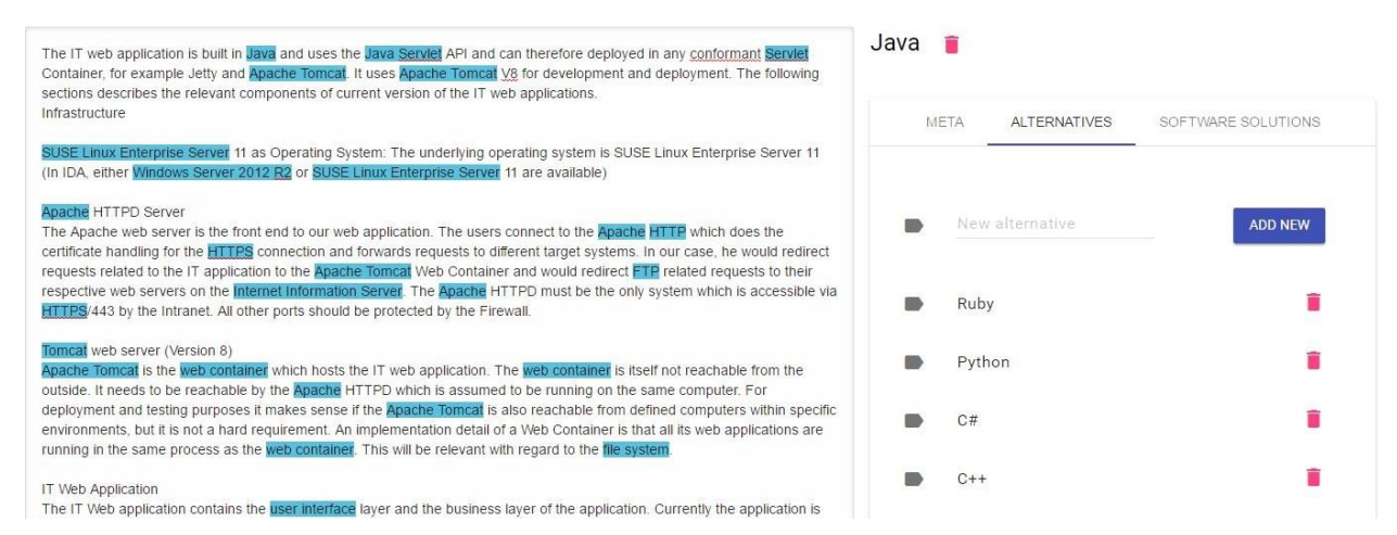
Figure 2. User interface of the recommendation system

within the DBpedia ontology, which are necessary for formulating the look-up queries (presented in Appendix A). Figure 3 presents the necessary concepts and their relationships.