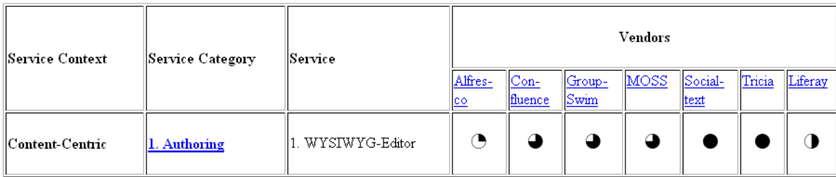
Figure 4: Ratings for WYSIWYG-Editor, Authoring